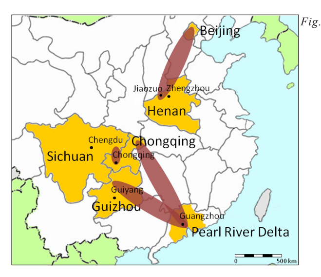
Fig. 1 The migration corridors studied (authors' design) / Die untersuchten Migrationskorridore

referred to as the Henan-Beijing corridor) with a distance of ca. 650 km by train;